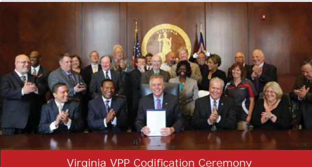
Virginia VPP Codification Ceremony

The VPP concept recognizes that enforcement alone can never fully achieve the objectives of the OSH Act. Exceptional safety and health management systems that go beyond VOSH standards can protect workers more effectively. The highest level of VPP recognition in Virginia is STAR. Virginia STAR participants are an elite group of facilities that have designed and implemented outstanding safety and health programs.