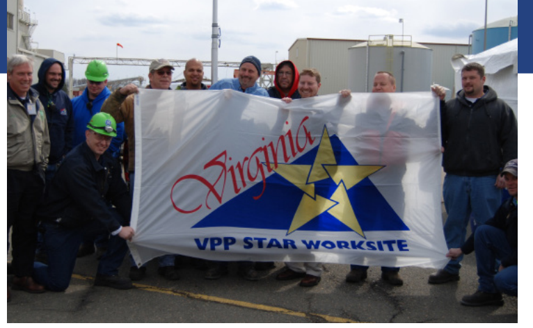
Birchwood Power VPP STAR Flag Raising Ceremony